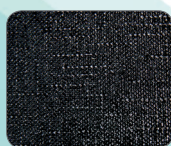
▲ Linen Texture

Various embossing effect for high value added products