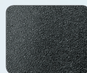
▲ Sparkler Texture