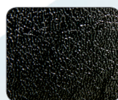
▲ Leather Texture