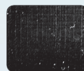
▲ Silky Texture